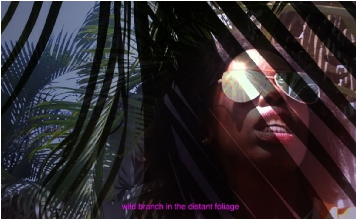
Julien Creuzet, LOVA LOVA, SAFARI GO, 2016. Video still, 9'17".

My interest in the notion of mobility began in 2008 when I was working on an experimental programme for disadvantaged youth at the SNCF Foundation (a charitable body set up by the French railway company). The project, entitled Transeuropéen , invited schools to travel to different European capitals for a period of three weeks. The pedagogical aspects focused on the preparation of the journey during classes held over several months. The aim was to promote another vision of European mobility and citizenship and to conclude with an artistic project.