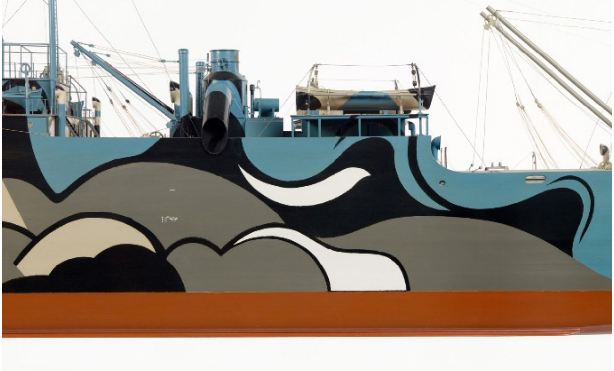
Figure 4: Detail of port side of SS War Drake, 1918.

NJS: I think it's intriguing to relate them to the dazzle scheme drawings because the earlier ones were very brightly coloured, as SS War Drake [Figure 4] shows with its bright blues and so on. They couldn't keep that up though, not least because of the wear and tear caused by the ocean. But as they went on they started to focus on just a few colours, usually subdued but with as strong a contrast as they could achieve. There's a terrific cartoon by Tommy Livingstone of a dazzle ship at Govan in Glasgow from January 1918 that's full of incredible colours –violet, emerald, blue, orange. [figure 5]