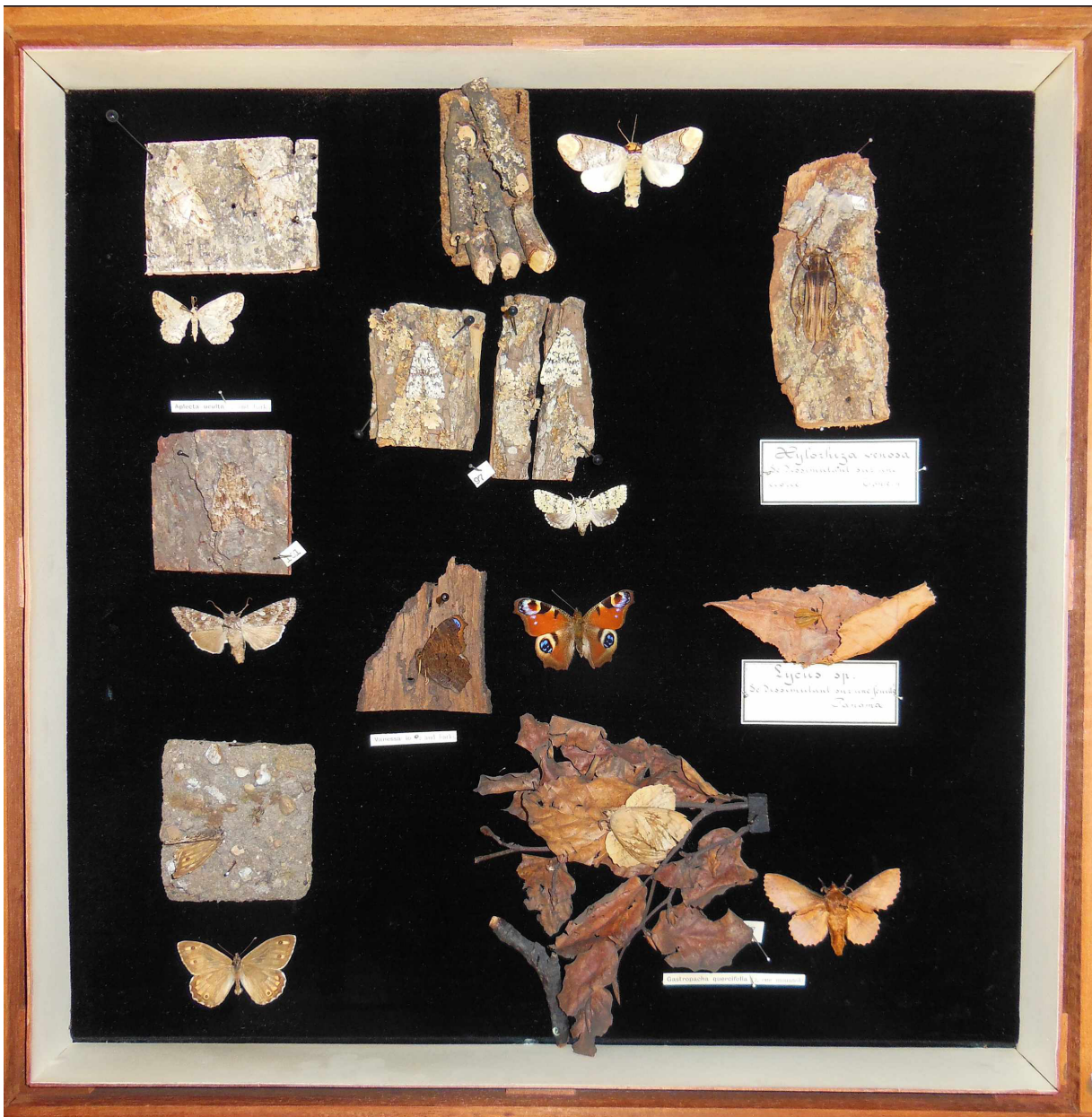
Figure 6: Teaching drawer from Hunterian Museum Collections Illustrating Animal Camouflage.

NJS: So he certainly devoted his life's work to this school of thought.