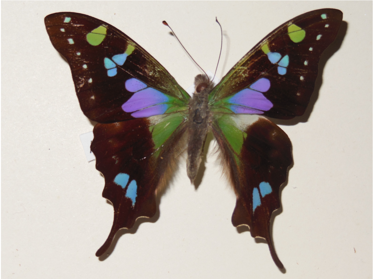
Figure 3: Purple Spotted Swallowtail ( Graphium Weiskei ) from the Hunterian Museum's Collections, University of Glasgow.

JR: Yes, the Swallowtail and Hairstreak butterflies. Quite often when you're capturing these you find their tail tips missing as a result of attacks by birds.