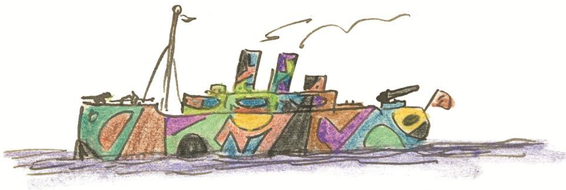
Figure 5: © Estate of Thomas Cairns Livingstone under licence to Shaun Sewell

NJS: I think it's intriguing to relate them to the dazzle scheme drawings because the earlier ones were very brightly coloured, as SS War Drake [Figure 4] shows with its bright blues and so on. They couldn't keep that up though, not least because of the wear and tear caused by the ocean. But as they went on they started to focus on just a few colours, usually subdued but with as strong a contrast as they could achieve. There's a terrific cartoon by Tommy Livingstone of a dazzle ship at Govan in Glasgow from January 1918 that's full of incredible colours –violet, emerald, blue, orange. [figure 5]